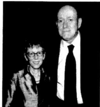
Literarian Award winner Terry Gross with her husband, writer Francis Davis.