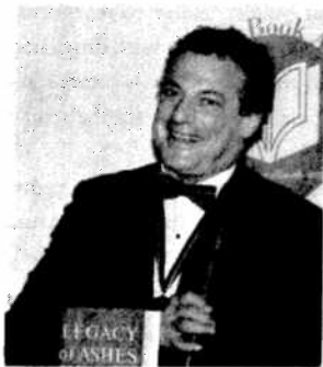
Nonfiction winner Tim Weiner.