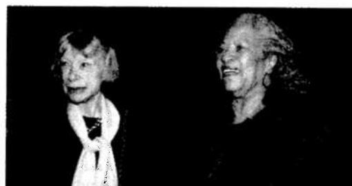
Joan Didion, NBA Lifetime Achievement honoree, along with Toni Morrison, past recipient of the same award.